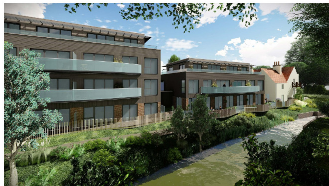
Specialist business property adviser Christie & Co has acquired a development site for housing with care operator, Birchgrove.

Birchgrove and partner Levanter Developments recently obtained planned permission for 53 extra care apartments at the Lower Mill site in Ewell, Surrey.