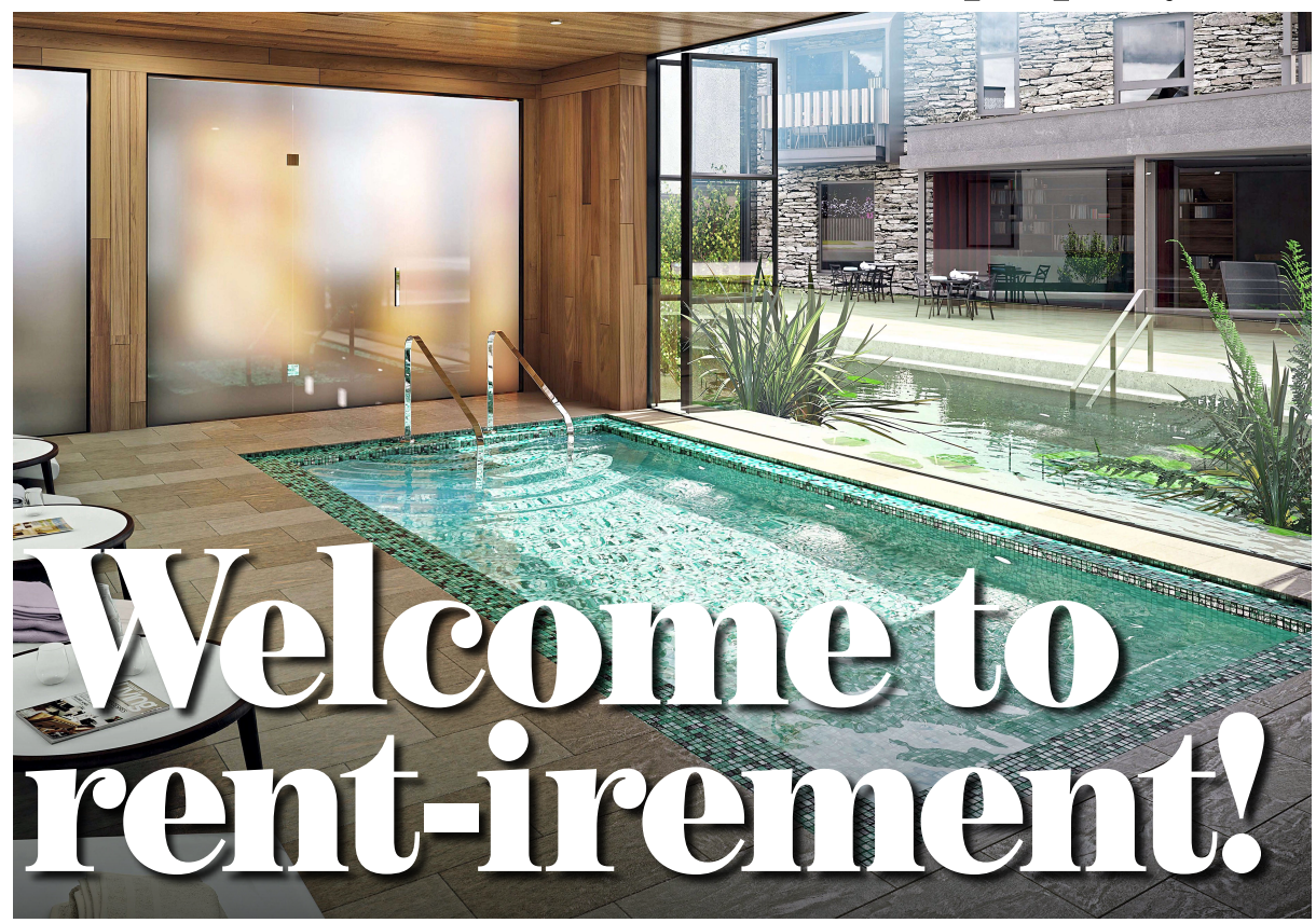
SPLASHING OUT: The pool and wellness centre at PegasusLife's retirement village in the Cotswolds

that 27 per cent of people between 55 and 85 said they would choose to rent instead of buy, citing a lack of stress, being able to live in a place where they could not afford to buy, avoiding stamp duty and